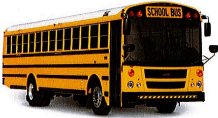
Front Engine Style

of the bus, behind the rear wheels; or between the front and rear axles. The entrance door is ahead of the front wheels. This type is also known as “transit-style school bus.”