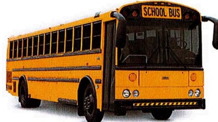
Rear Engine Style