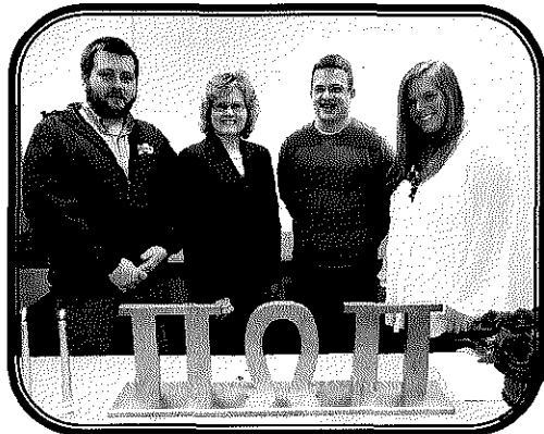
Alpha Pi Chapter of Pi Omega Pi ranked in top 10 for the last 16 years