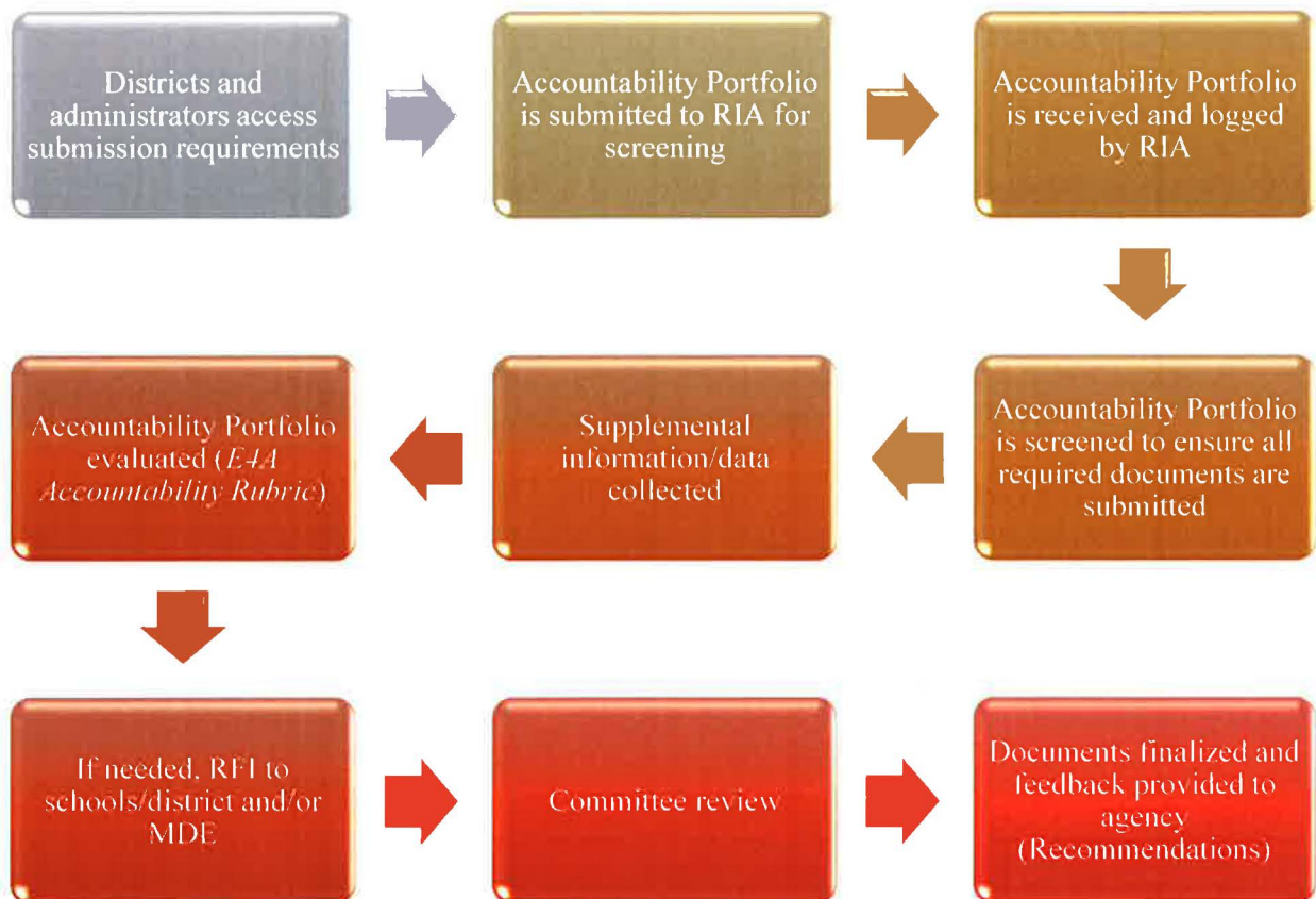
Figure 1. Macro-Level Workflow