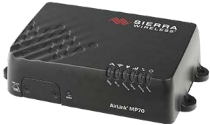
MP70 Mobile Gateway With 3x3 Wi-Fi