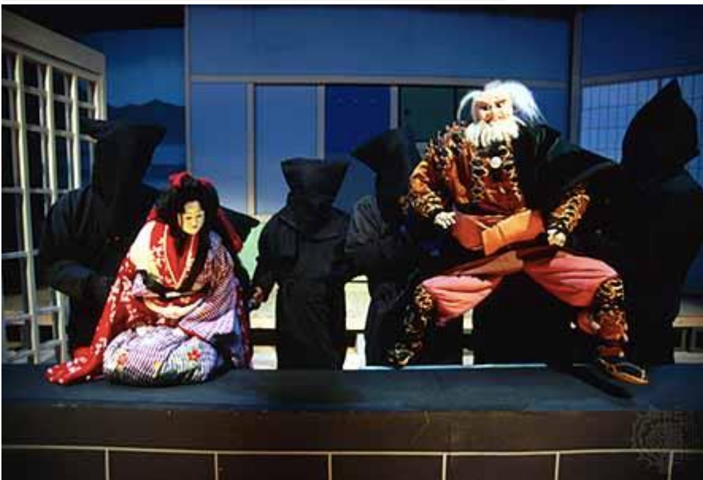
Bunraku puppets are typically controlled by three or four actors.