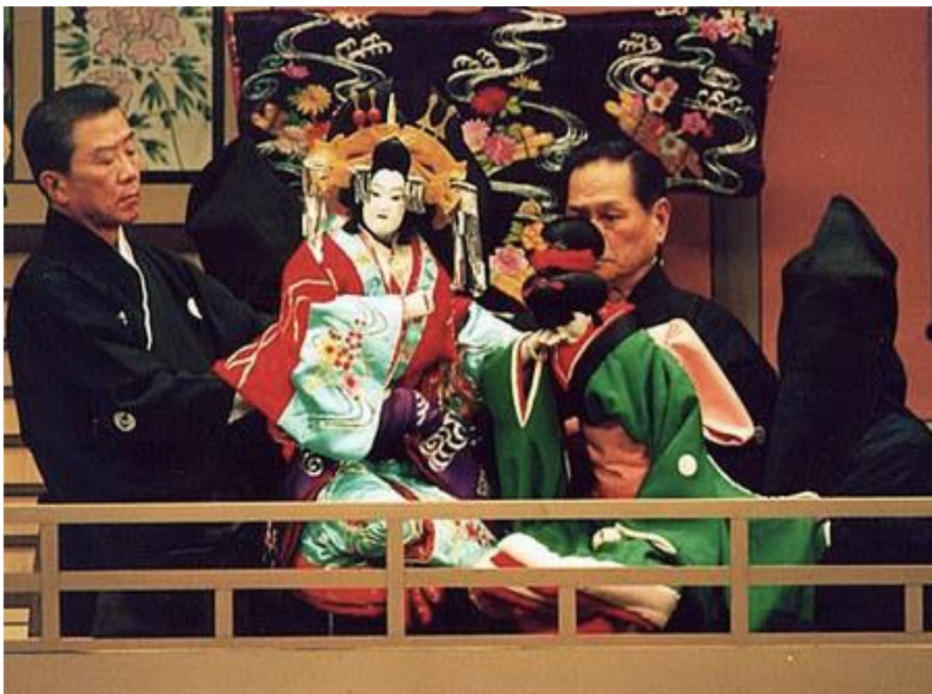
Bunraku is a kind of puppet theatre from Osaka, Japan.