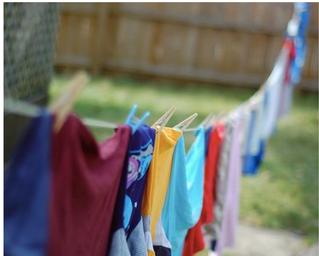
Some people hang their laundry on a clothesline to dry.