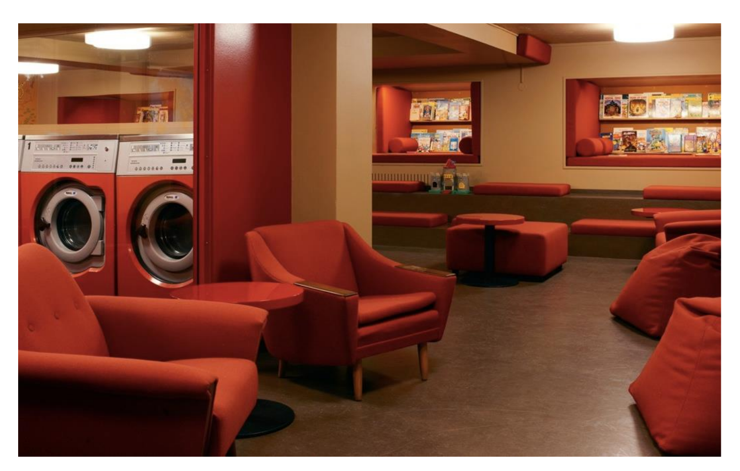
Some people wash and dry their clothes at an indoor laundromat.