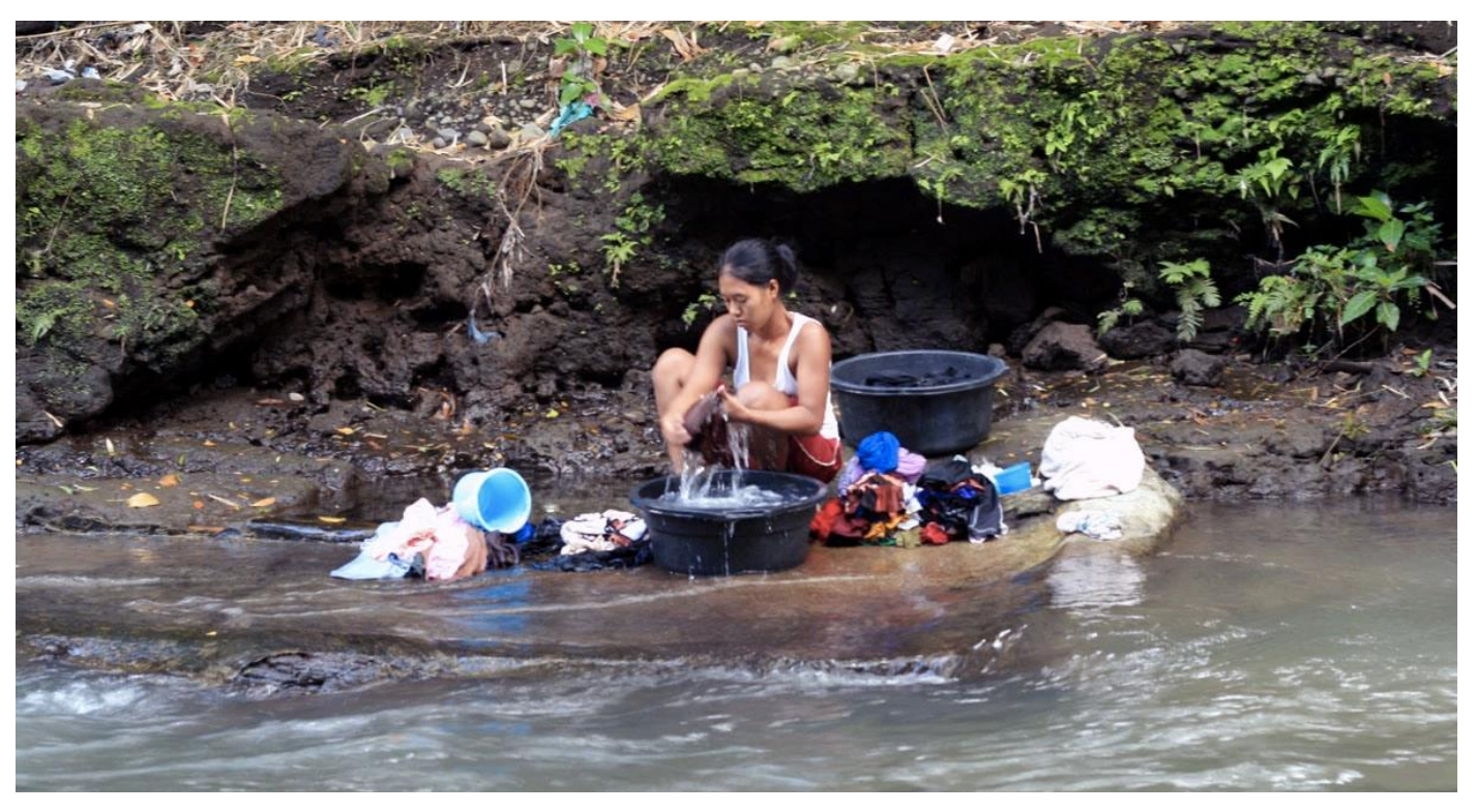
Some people wash their laundry in a river.