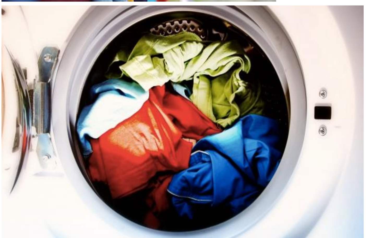
Some people use a drying machine to dry their laundry.