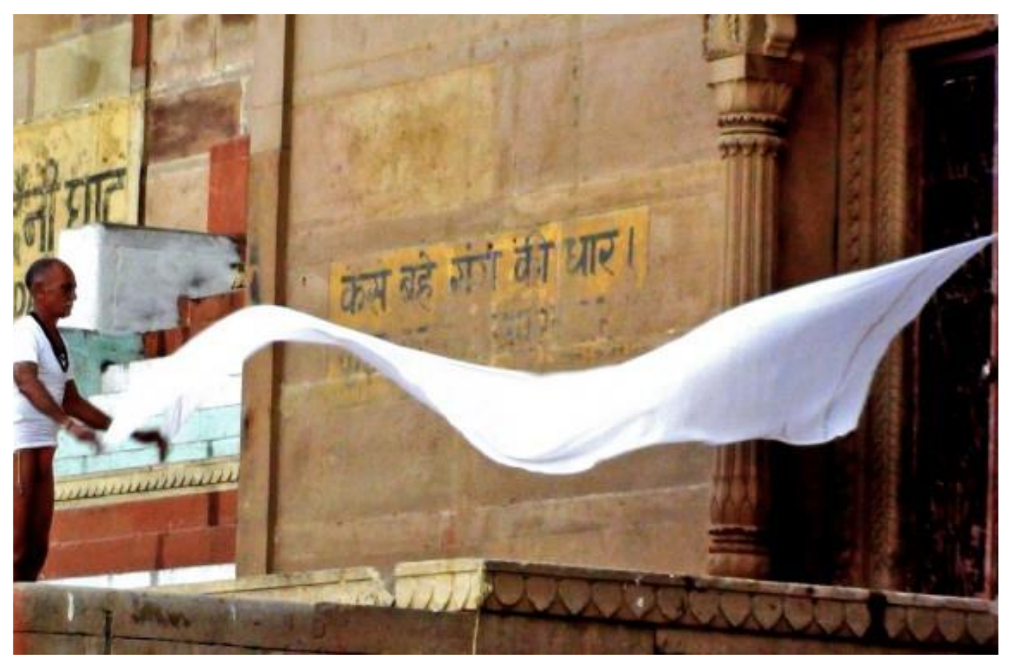
People do laundry all around the world.