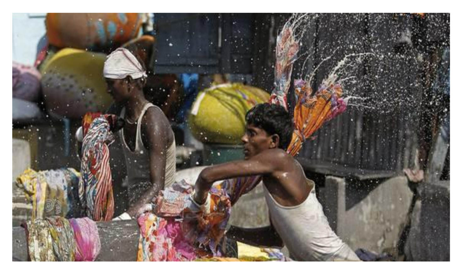
Some people wash and dry their clothes at an outdoor laundromat.