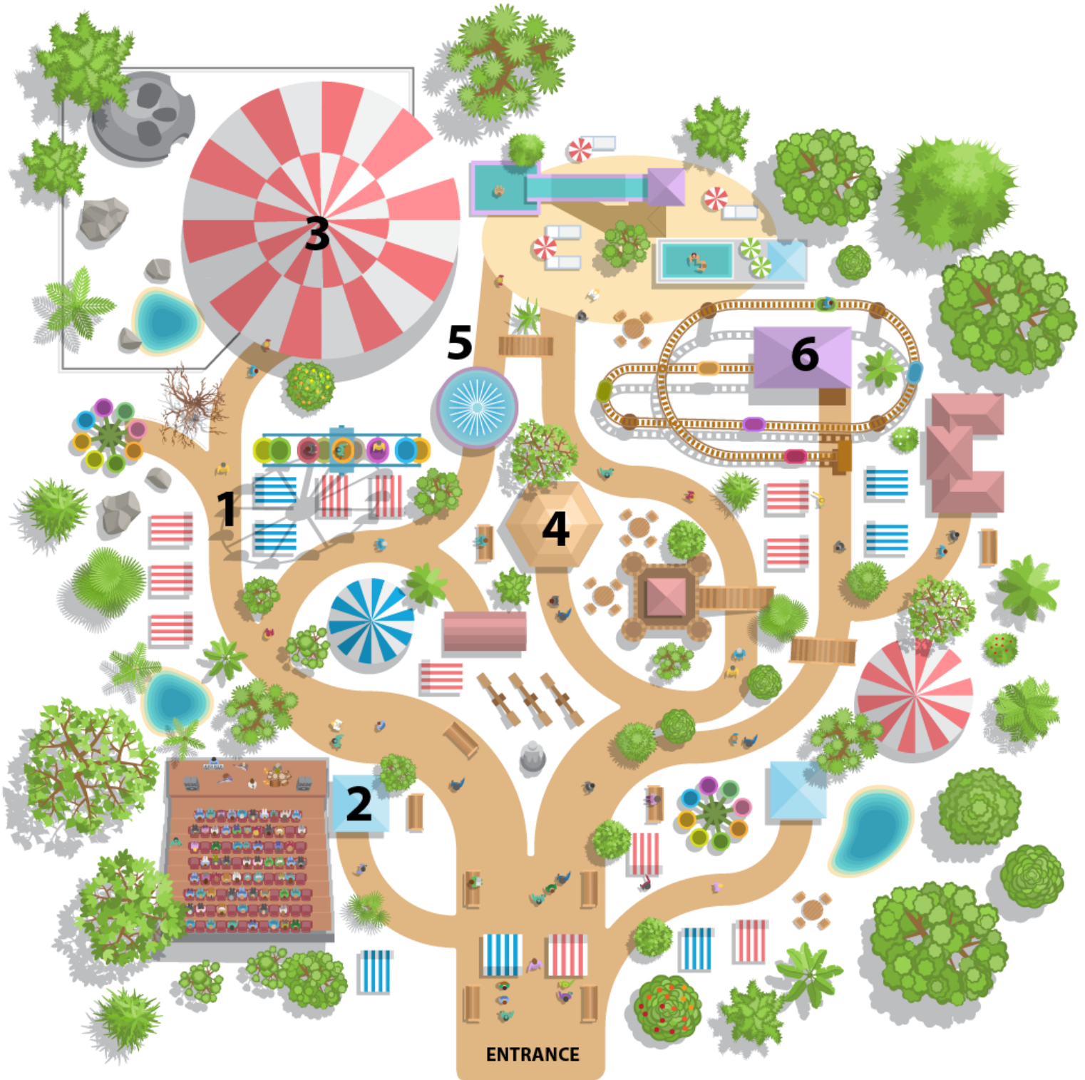
1 FERRIS WHEEL & SNACK STANDS