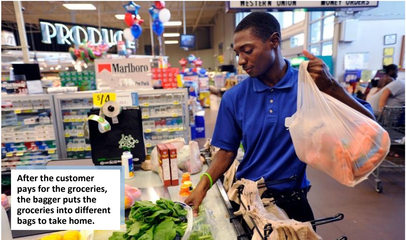
After the customer pays for the groceries, the bagger puts the groceries into different bags to take home.