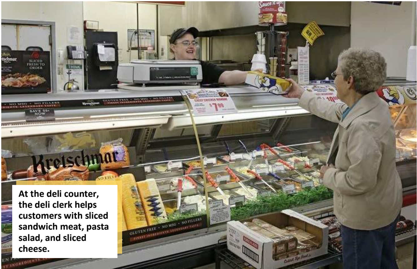
At the deli counter, the deli clerk helps customers with sliced sandwich meat, pasta salad, and sliced cheese.