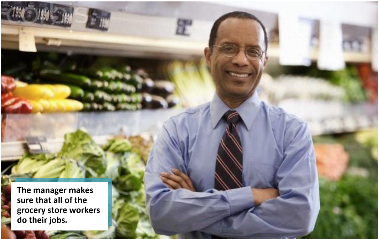
The manager makes sure that all of the grocery store workers do their jobs.