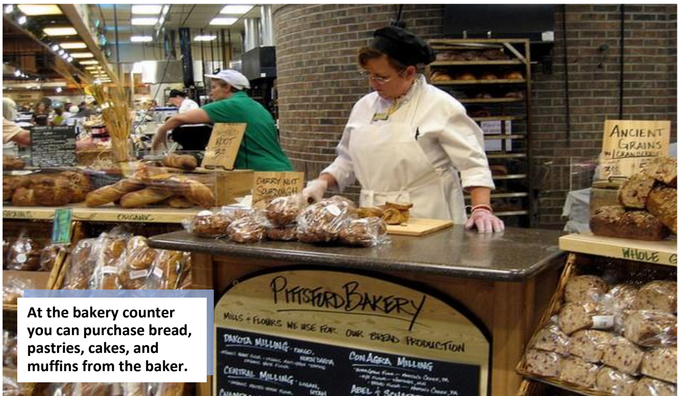
At the bakery counter you can purchase bread, pastries, cakes, and muffins from the baker.