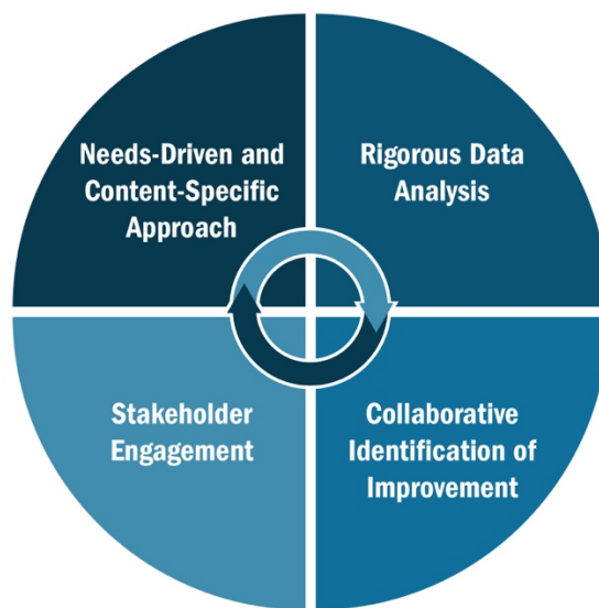
Figure 2. Four Elements Essential for Successful Needs Assessment

A successful needs assessment leads to actionable priorities and meaningful, long-term change. Achieving these results requires more than just one or two people completing a form behind closed doors; it requires active and meaningful engagement of all concerned stakeholders in a process to examine, identify, and diagnose the challenges that need to be addressed for improvement to occur. The Elements of a Successful Needs Assessment framework presented in Figure 2 is informed by a review of the current research on needs assessment and the State Support Network’s work with a number of states to examine and develop needs assessments. The framework illustrates key considerations for a robust and meaningful needs assessment process.