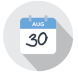
Monthly Planning Calendar