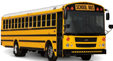
Front Engine Style

A Type D school bus is a body installed upon a chassis, with the engine mounted in the front, mid bus, or rear with a gross vehicle weight rating of more than 10,000 pounds. The engine may be behind the windshield and beside the driver's seat; it may be at the rear of the bus, behind the rear wheels; or between the front and rear axles. The entrance door is ahead of the front wheels. This type is also known as "transit-style school bus."