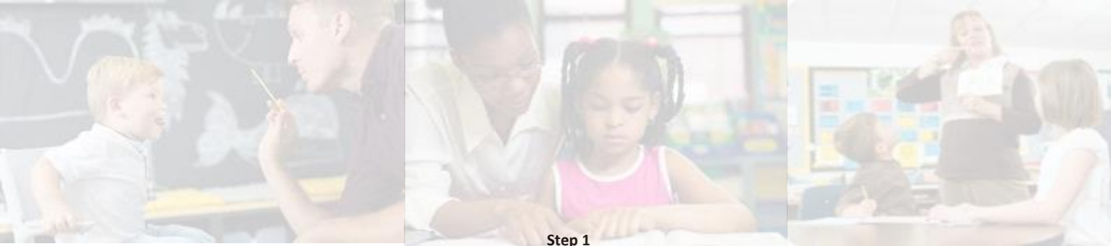
Review Growth Rubric for Speech/Language Pathologist